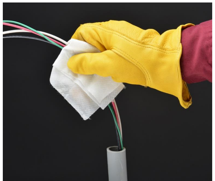
Wipe application with Polywater SPY-D20

Polywater SPY wipe package (SPY-D20) is a convenient way to apply lubricant for shorter cable runs. Each wipe coats and lubricates 50 to 100 feet (15 to 30 meters) of cable. Use additional wipes as needed for longer, larger, or more difficult pulls. A light coating of Polywater SPY facilitates cable pushing or pulling.