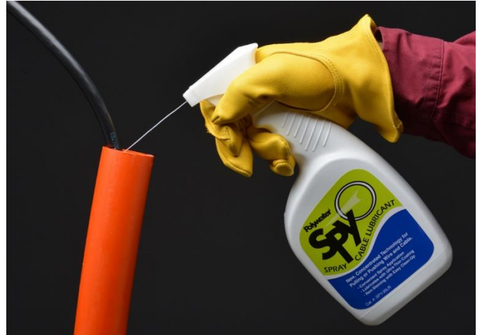
Polywater Spy can be sprayed directly into ducts or onto cables

Coefficient of friction data on additional or specific cable jackets or conduits can be obtained from American Polywater Corporation.